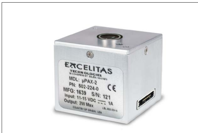
μPAX-2 Pulsed Xenon Light Source for UV/Vis/NIR Applications

The μPAX-2 from Excelitas Technologies is a 2 Watt Pulsed Xenon Light Source which has been designed to combine an innovative new lamp design with state-of-the-art circuitry and components into a packaged light source which provides microsecond-duration pulses of broadband light with exceptional arc stability. The compact, integrated solution contains the flash lamp, trigger circuit, and power supply in an EMI-suppressant enclosure.